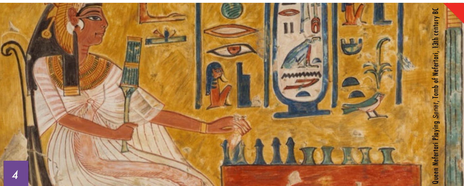
Queen Nefertari Playing Senet, Tomb of Nefertari, 13th century BC