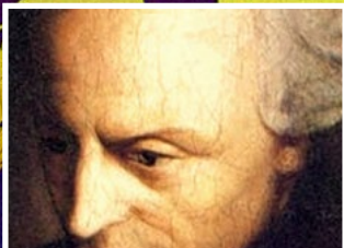
Immanuel Kant and 'Perpetual Peace' - Page 2