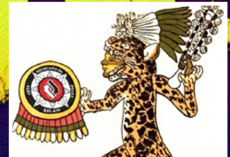
The Mexican Martial Art of Xilam - Page 7