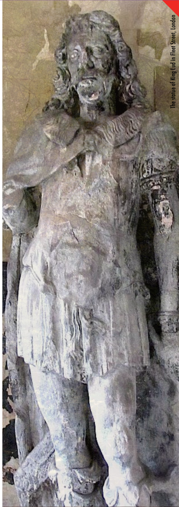
The statue of King Lud in Fleet Street, London

Today we can see the statue of King Lud along with the statues of his two sons in St. Dunstan-in-the-West. It was made in the 13th century and bears the marks of time. Whether real or legendary, King Lud lives in history and reminds us of care for the beloved city.