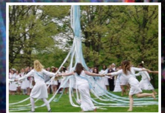
Maypole Dancing - Page 8