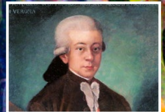
Mozart and Freemasonry Page 5