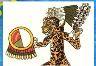
The World of the Aztecs - Page 9