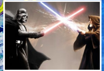
The Heroic Spirit - Page 3