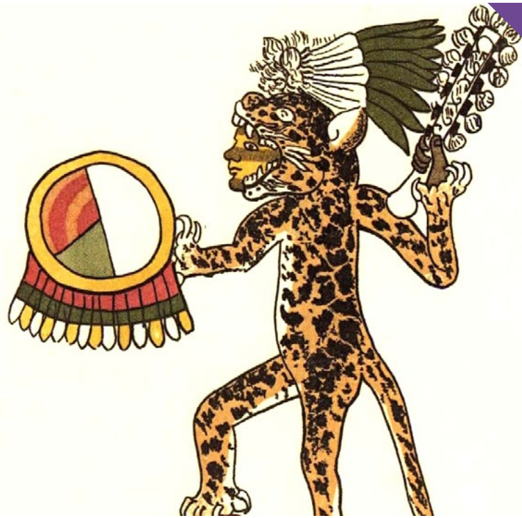
Jaguar warrior, from the Codex Magliabechiano

Nature, signs in nature and dreams played an important role in the way the Aztecs decided to lead their lives. They drew much of their knowledge from nature itself, thus developing a highly elaborate calendar system which was split into a solar calendar