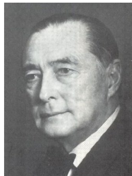
Richard Nicolaus Graf Coudenhove-Kalergi

integration, the Count of Coudenhove-Kalergi (1894-1972), was of the opinion that Britain would have been better off forming a union with its own Commonwealth, guided by its system of Common Law, just as the European Union is guided by its own system of European Law. Whether or not this would still be valid today is another question, but it would be another way of